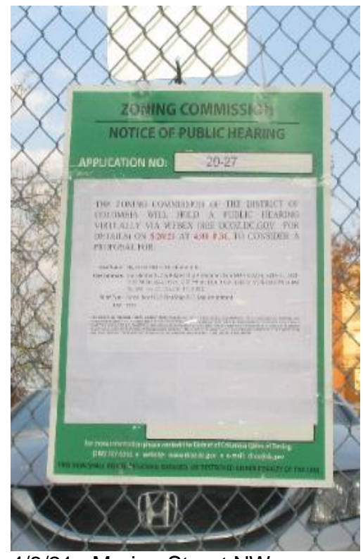
4/8/21 Marion Street NW